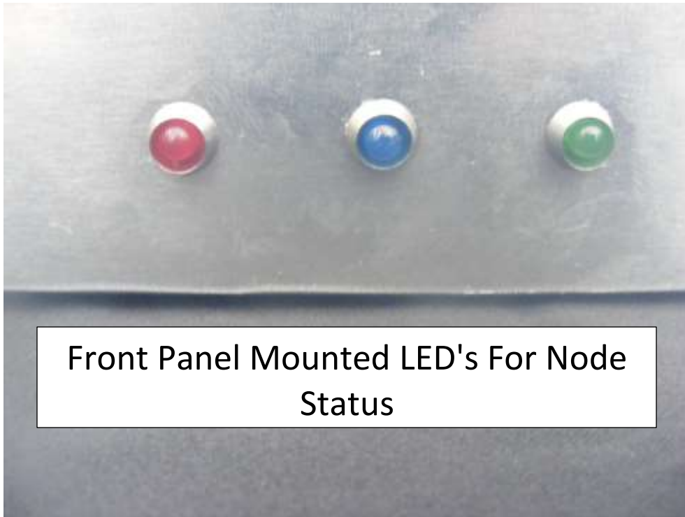
Front Panel Mounted LED's For Node Status