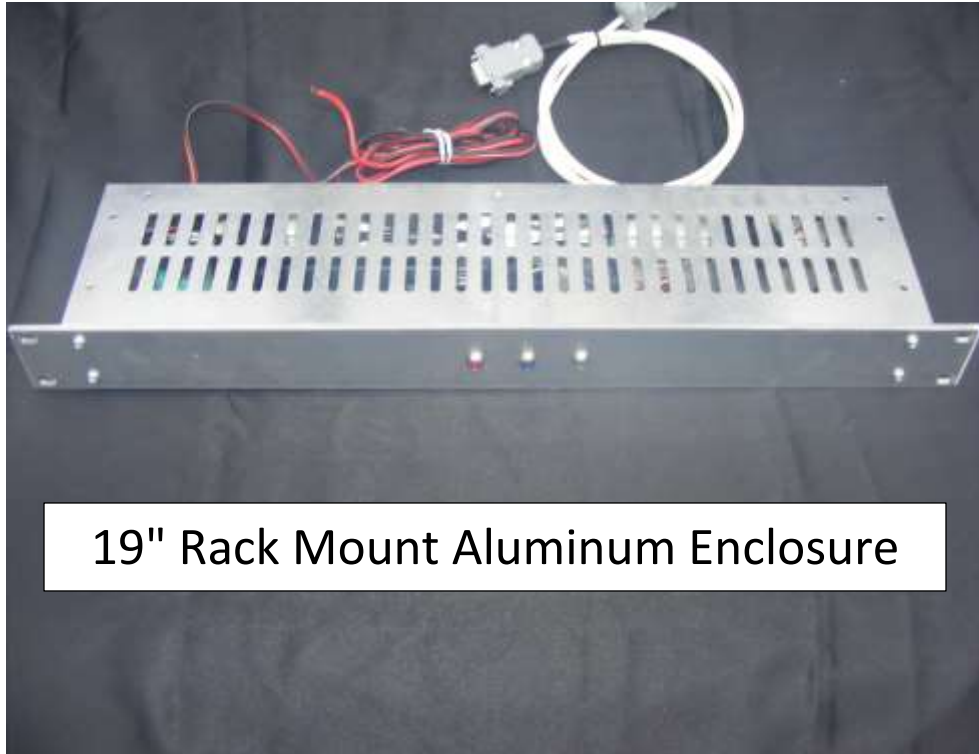
19" Rack Mount Aluminum Enclosure